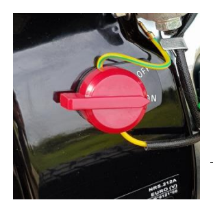
Fig1: Engine on - off switch:

Must be on when starting and switch to off position to stop motor