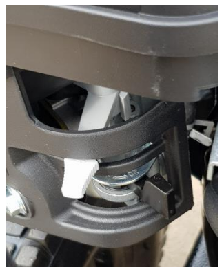
Fig 3: Engine Fuel tap lever (black) and choke lever (grey)

The figure shown is the starting position before pulling the pull cord when the engine is cold. Black lever to the right (on position) – this stays in this position throughout the operation; Grey lever to the left (on position) – this choke lever is moved immediately to the right (off position) when the engine starts running.