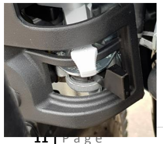
Fig4: Warm start or trouble start position - Engine Fuel tap lever (black) to the right and choke lever (grey) in centre position. Don't forget to move this choke lever immediately to the right (off position) when the engine starts running

The figure shown is the starting position before pulling the pull cord when the engine is cold. Black lever to the right (on position) – this stays in this position throughout the operation; Grey lever to the left (on position) – this choke lever is moved immediately to the right (off position) when the engine starts running.